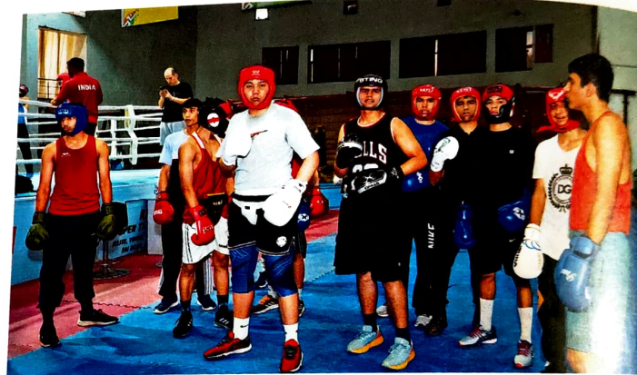
▲ Podiums and Punches: the victorious spirit in athletics and boxing, fuelling dreams and dedication

particularly shoes, in an athlete’s career.