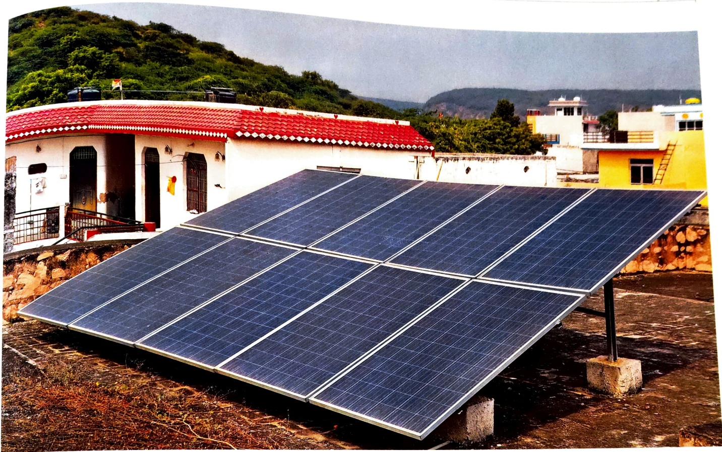
▲ Sustainable living in Alipur, Sohna: An Anganwadi powered by Solar Energy