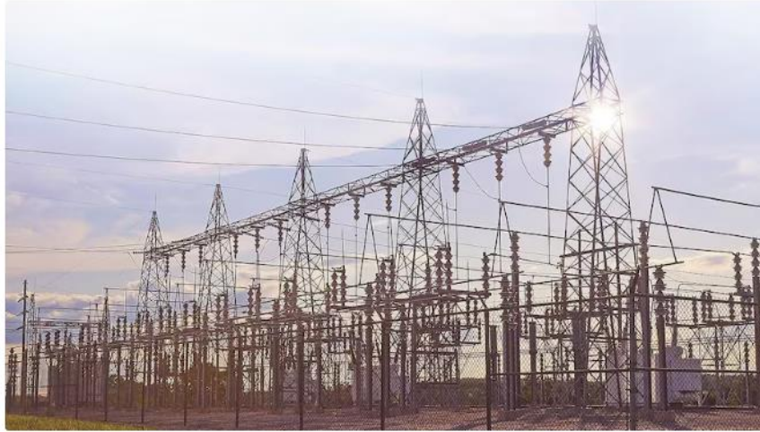
REC, Under Ministry Of Power, Is A Non-Banking Finance Company, Public Financial Institution, And Infrastructure Financing

State-owned REC Ltd on Friday said its board has approved raising the borrowing limit in foreign currency to $24 billion from $20 billion.