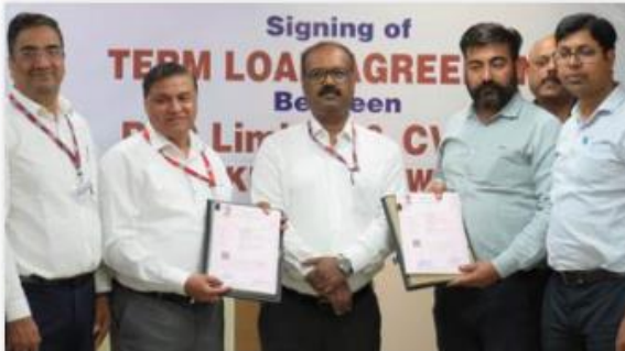
REC to extend term loan of Rs 1,869 cr for Kiru Hydro Electric Project in Kishtwar

New Delhi [India], April 24 (ANI): REC Limited, a Maharatna Central Public Sector Enterprise and an NBFC under the Ministry of Power has signed an agreement with Chenab Valley Power Project Private Limited (CVPPPL), under which REC will provide CVPPL with the financial assistance of Rs 1,869.265 crores as term loan.