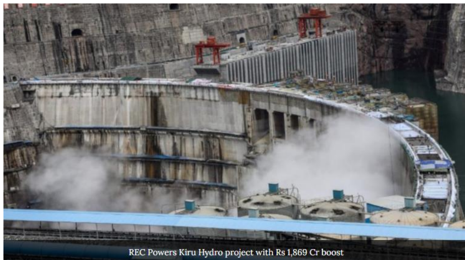
REC Powers Kiru Hydro project with Rs 1,869 Cr boost

REC Limited, a Maharatna Central Public Sector Enterprise and NBFC under the Ministry of Power, has entered an agreement with Chenab Valley Power Project Private Limited (CVPPPL) to provide financial assistance of Rs 1,869.265 crores as a term loan. The loan will support the development, construction, and operation of the Kiru Hydro Electric Project, a [...]