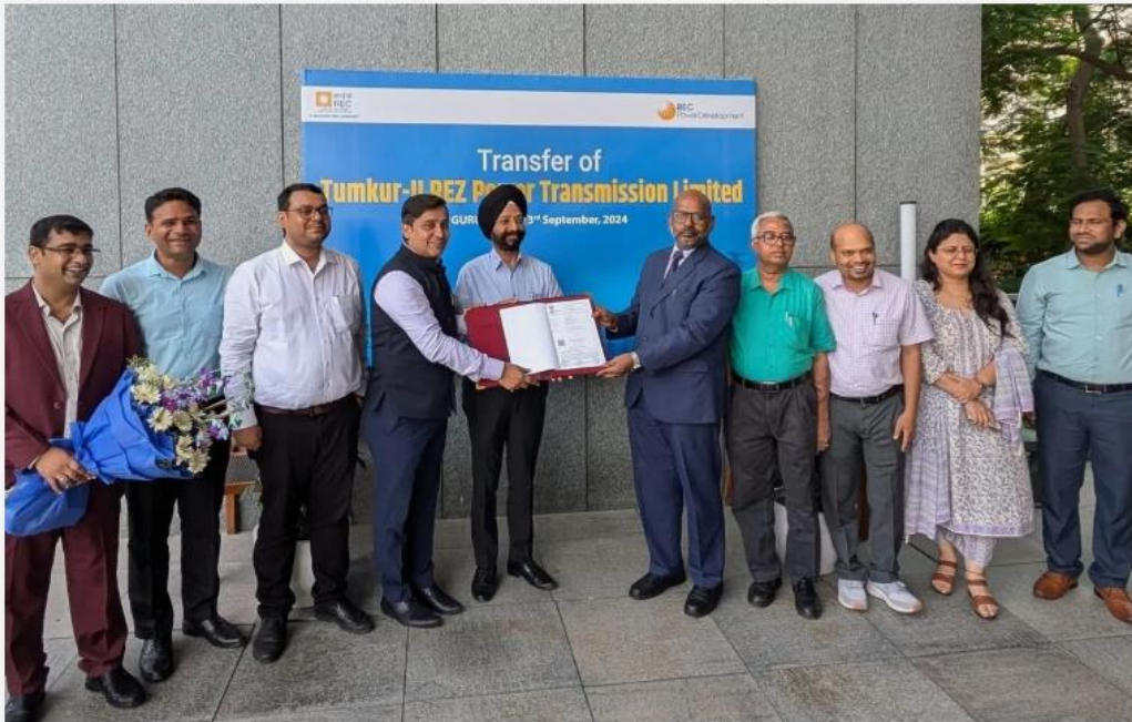
REC Arm Hands Over Tumkur-II REZ Power Transmission Limited

Gurugram: REC Power Development and Consultancy Limited (RECPDCL), a wholly owned subsidiary of REC Limited, the Maharatna CPSU under the aegis of Ministry of Power, handed over a project specific SPV (Special Purpose Vehicle). viz, Tumkur-II REZ Power Transmission Limited to M/s G.R. Infraprojects Limited (GRIL) on 03rd September, 2024 at Gurugram.